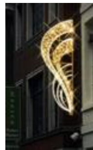
1.17. Paalmotief IPL029W