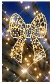
1.13. 2D Object: Pakjes (boom) IPL027W