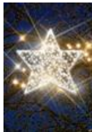
1.14. 2D objects: sterren (boom) ITL025W