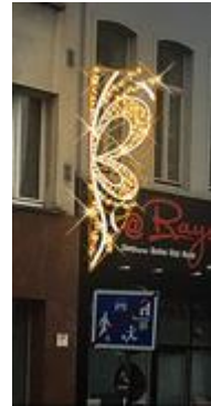
1.16. Paalmotief IPL075W