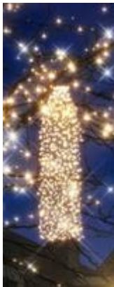
1.10. Licht - werval (boom) BRIN480W